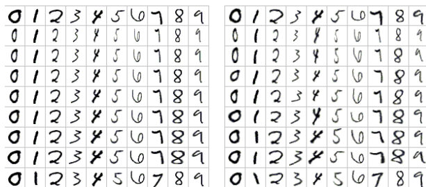
Figure 2. (Left panel) Different preprocessing for ten digits from MNIST. From top to bottom: original, 8, 10, 12, 14, 16, 18, 20, deslanted. (Right panel) Similar but with deformations (see text for explanation).

The experiments performed with these nine different data sets will henceforth be referred to as the experiments with preprocessed data. Figure 2 shows ten digits from MNIST preprocessed as described above (left) and the same digits with additional deformations (right). The first row corresponds to original digits whereas from the second row downwards increasing bounding box normalization from 8 to 20 pixels is applied, the last row corresponds to deslanted digits.