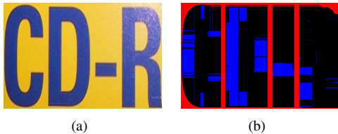
Figure 2. (a) Input Image (b) Its foreground-background seeds, Red and blue colour shows foreground and background seeds respectively (Best viewed in colour).