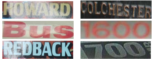
Figure 1. Some samples images we considered in this work

We, in this work, focus on binarization of natural scene text. Natural scene texts contain numerous degradations not usually present in machine printed ones such as uneven lighting, blur, complex background, perspective distortion, multiple colours etc. Methods such as interactive graph cut by Boykov et al. [2] and thereafter GrabCut [3] have shown promising performance in foreground/background segmentation of natural scenes in recent years. We formulate