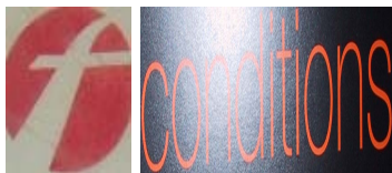
Figure 3. Images where auto-seeding fails

Although the proposed auto-seeding method performs satisfactorily well, it tends to fail in cases where Canny edge operator produces too many noisy or broken edges. In such cases some foreground regions are falsely marked as background and vice-versa, which leads to poor binarization. We show two such examples in Figure 3, where our auto-seeding algorithm fails to mark foreground-background regions appropriately.